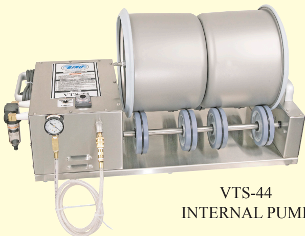
VTS-44 INTERNAL PUMP