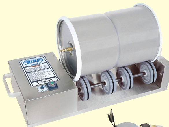
VTS-43 REMOTE PUMP SHOWN