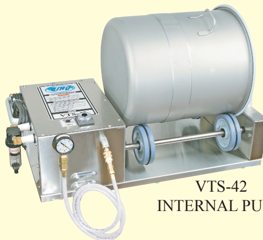
VTS-42 INTERNAL PUMP

Color and eye appeal are enhanced, product yield is increased, and shelf life extended. When the batch is complete, it takes only a few minutes to empty the drum, wash the drum, and you are ready to process the next batch. Adding product value will give your profit margins a boost. BIRO offers a range of tabletop Tumblers with various drum capacities. See reverse side of this literature.