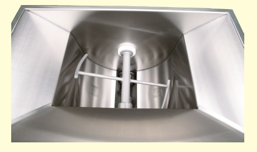
PADDLE SHOWN INSTALLED IN HOPPER

L = 49" (1244 mm), W = 38" (965 mm), H = 65" (1651 mm).